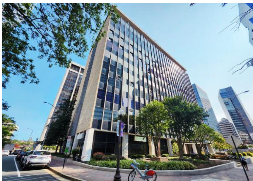
UMT headquarters on seventh floor

UMT's faculty and staff have extensive management and education experience working with major universities, companies, nonprofit organizations, and government agencies. These entities include government branches, such as The White House, the National Institute of Standards and Technology, the Department of Defense, the Department of Energy, the Department of States, the National Health Institute, the Internal Revenue Service, and the Social Security Administration; large corporations, such as AT&T, Lucent Technologies, NCR, SITA (France), ABB (Switzerland and Sweden), IBM, Motorola, Hewlett-Packard, Verizon; and international organizations, such as the World Bank. UMT's faculty and staff possess extensive international experience having worked in more than twenty countries and recognize that management today requires a global outlook.