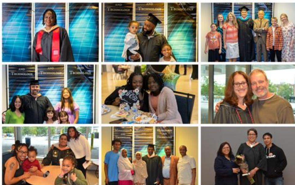
UMT 2023 Commencement