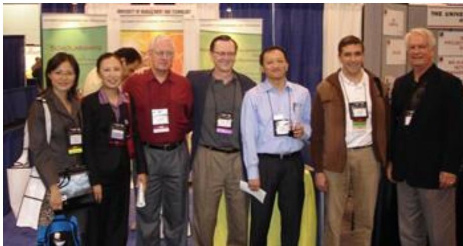
UMT President and Academic Dean attending the Project Management Institute Global Congress.