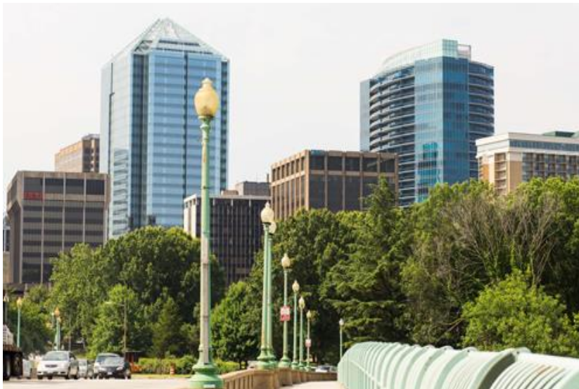
View of UMT Headquarters in Rosslyn, Arlington, VA neighborhood

STAT 695 Advanced Research Methods. This graduate level course reviews the principal techniques employed in conducting social science research, including: research design, design of experiments, sampling methodology, survey research, interviews, measurement, scales and indexes, quasi-experimental design, qualitative analysis, and quantitative analysis. The course also examines the link between research theory and practice.