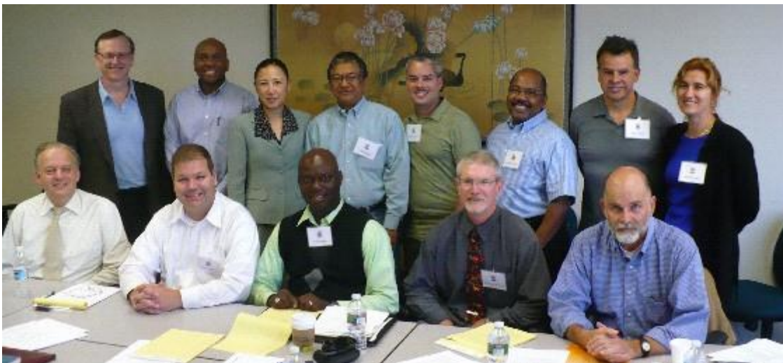
UMT faculty and DBA students and attending DBA Colloquium

Every student who chooses to enter the program must be committed to making a significant contribution to the intellectual knowledge base in the management arena. They may do this in course, through research, through publications, and by their participation in seminars, colloquia, and professional meetings. In addition, students must complete required doctoral level courses successfully and maintain an average GPA of 3.3 or above.