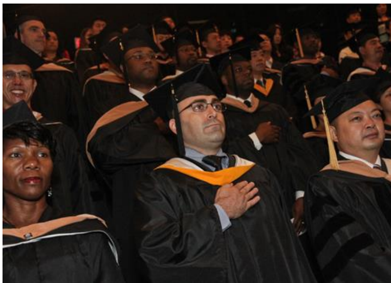
UMT graduates standing at attention and saluting during the National Anthem being played at the Commencement.