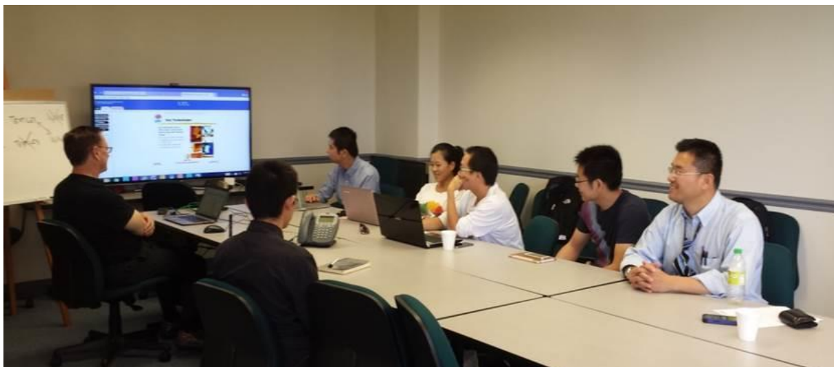
J-1 and F-1 students studying during a seminar session