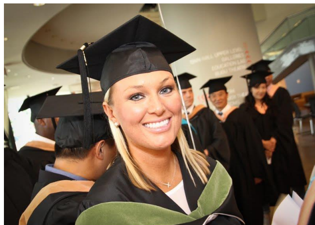
UMT graduates lining up for Procession of Graduates at the UMT Commencement

An undergraduate student may choose to progress through a bachelor's degree by completing a two-year, lower-level associate degree and then a two-year, upper-level bachelor's degree, or directly enroll into a four-year bachelor's degree of study.