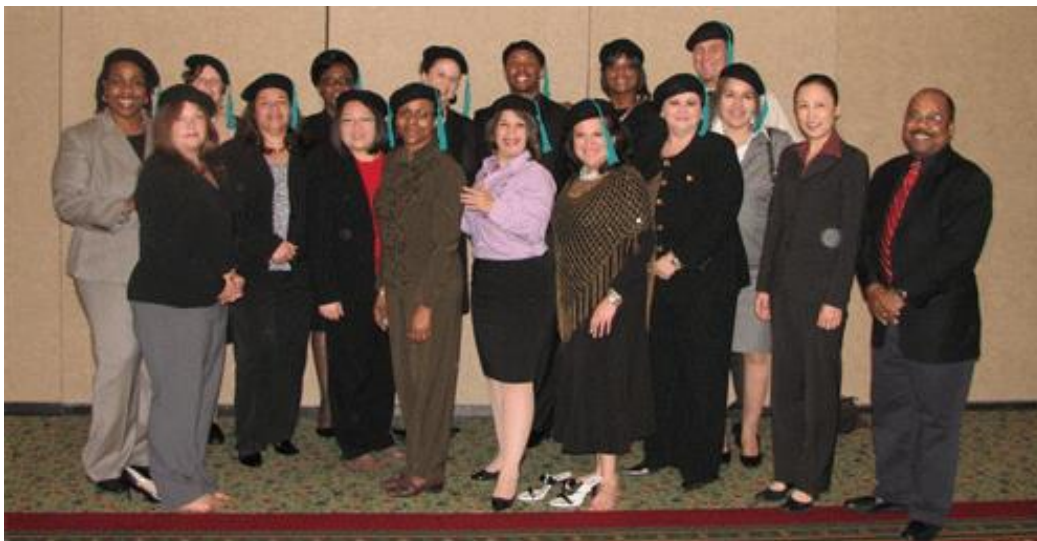
UMT DCMA Program Graduation