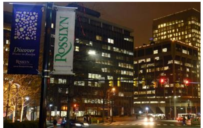
UMT Headquarters in Rosslyn, Arlington, VA