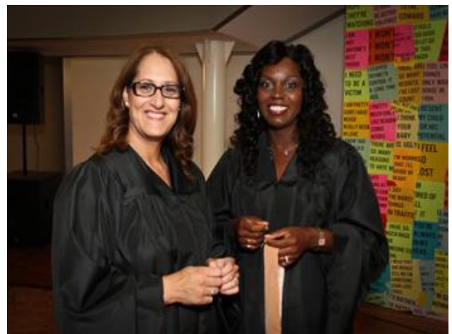
UMT graduates at the Commencement