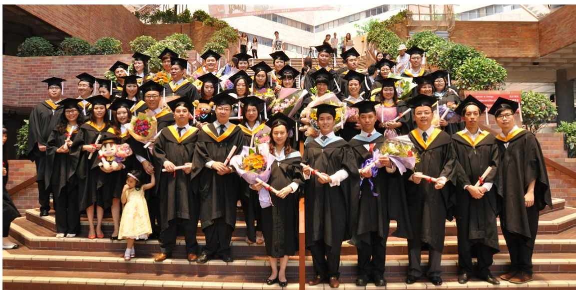
UMT Commencement in Hong Kong

* All programs require COMM 110, ENGL 101, HUM 100 and MATH 105 as well as either PSY 100 or SOC 100